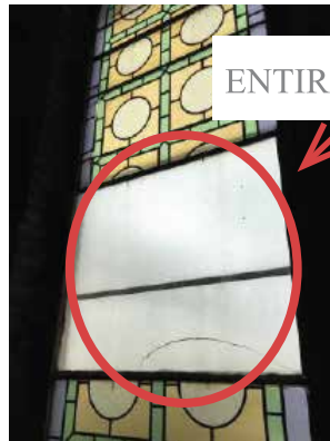
ENTIRE PANELS MISSING