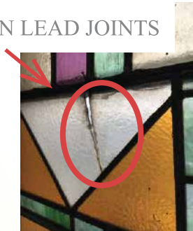
BROKEN LEAD JOINTS