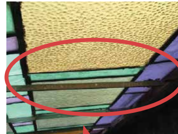
STAINED GLASS PULLING AWAY FROM RE-ENFORCING BARS