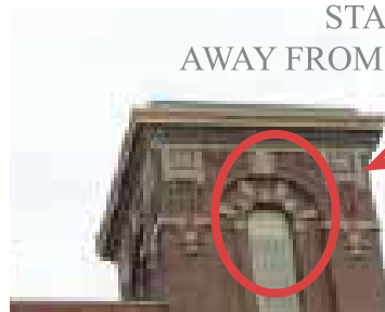
STAINED GLASS IS BOARDED UP DUE TO POOR CONDITION